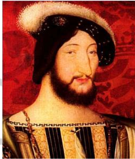
Figure 5: Francis I, King of France

In 1511, Pope Julius II formed a Holy League, composed of Spain, Venice, the Swiss Cantons and the Holy Roman Empire, in order to free Italy from French influence. Henry, hoping to capitalize on the alliance against France and expand England's territorial holdings, joined the alliance. This prompted his first military venture, a campaign into France in 1513, in which