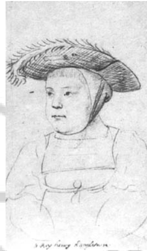
Figure 2: Henry VIII as a child

musician, truly embodying the modern conception of a Renaissance man. 4