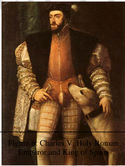
Figure 6: Charles V, Holy Roman Emperor and King of Spain

During committee, each of you will be responsible for advising Henry as to how he should proceed with respect to