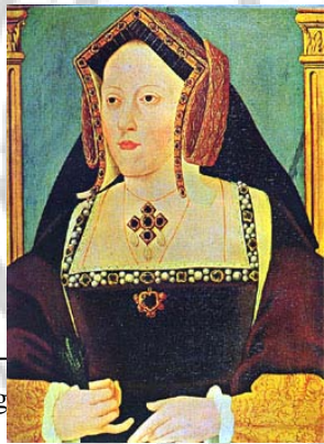
Fig. 1. Catherine of Aragon, wife of Henry VIII.

In April of 1509, Henry VII died, and 18, VIII, at age Henry a