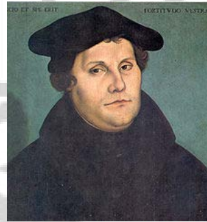
Figure 1: Martin Luther, leader of the Protestant Reformation

Ninety Five Theses , which challenged the very structure and many common practices of the Catholic Church. Primarily, he contested the Catholic hierarchy, arguing Christians could only attain salvation “by faith alone.” These teachings undermined the traditional doctrine, which placed priests and the Pope, in particular, as necessary intermediaries between the people and God. Similarly, his emphasis on lay piety put age-old religious concerns in the forefront of the peoples' minds, granting them license finally to challenge the teachings of the Church and its leaders. The invention of the printing press and increased literacy facilitated the rapid spread of Luther's ideas throughout Europe. The Protestant Reformation served as an important precedent in undermining what many people once viewed as an unquestionably infallible institution, the Roman Catholic Church. 2