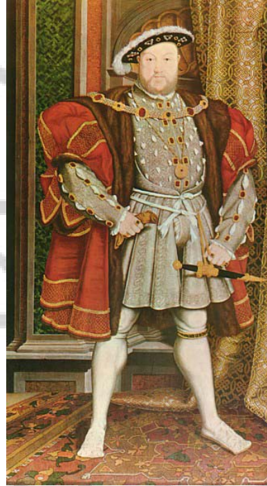
Figure 7: King Henry VIII